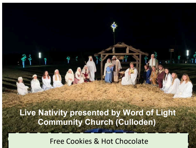
Live Nativity presented by Word of Light Community Church (Culloden)

Free Cookies & Hot Chocolate First Friday & Saturday, Dec. 1 & 2. Friday – 6:30pm-9:00pm Saturday – 6:00pm-9:00pm Valley Park, Hurricane