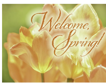
Spring begins March 20

For more info on how to be a part of the directory or how to put it on your computer or phone, please contact the church office.