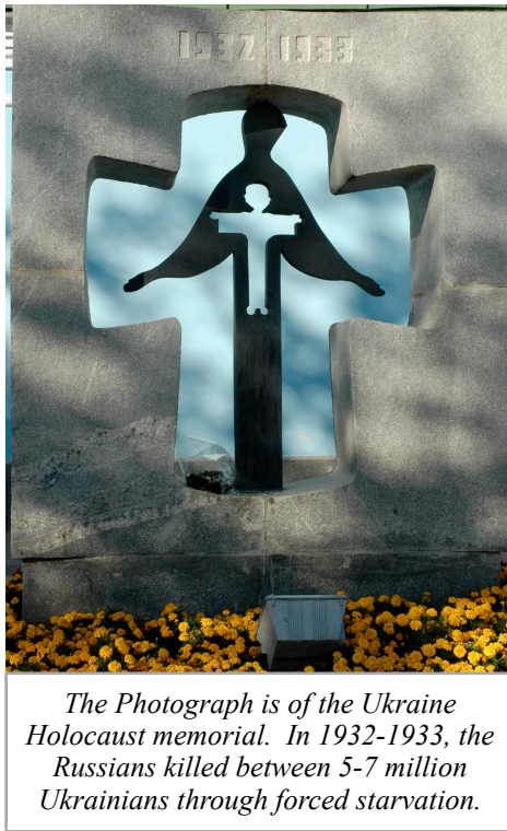
The Photograph is of the Ukraine Holocaust memorial. In 1932-1933, the Russians killed between 5-7 million Ukrainians through forced starvation.