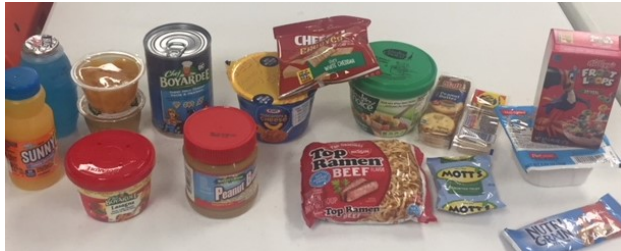
The Food Pantry appreciates any and all donations received toward helping us fill these backpacks.

Food Pantry: In the month of August our food pantry was able to service 242 families totaling 566 people (171 children, 307 adults, 88 seniors). They were also able to distributed 240 hygiene kits. They are also getting ready to start the backpack ministry at Highlawn Elementary. They have been providing 50 back packs/week, but this year we will be increasing that number to 60/week.